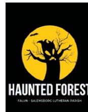
Falun-Salemsborg Haunted Trail Tony's Event Center